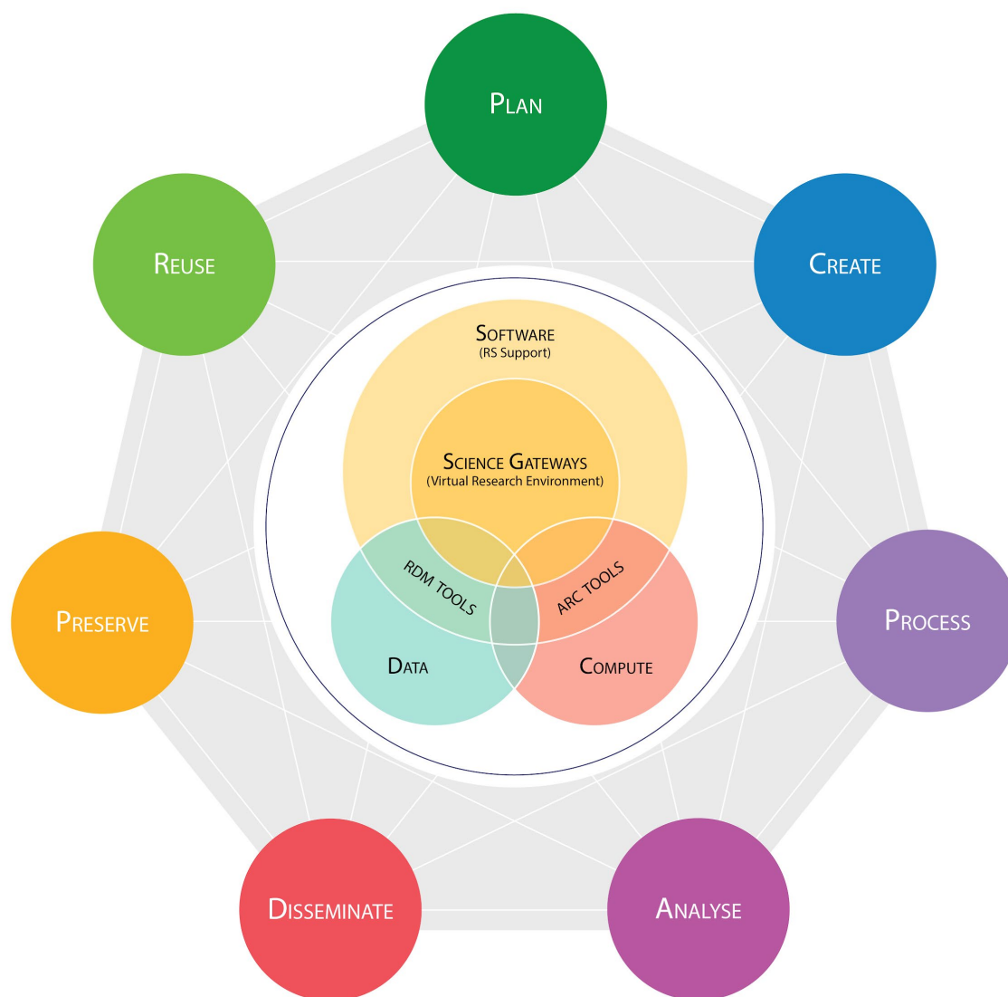
Figure 3: The research lifecycle and RS (see Appendix B and Appendix C ).

Interrelationships among Data, Compute and RS (inner circles) overlaying research lifecycle phases (outer circles). Users & Research Communities who are the agents that are engaged in the activities with RS are omitted in all these activities. Modified from the Data Management (DM) Position Paper: For Innovation, Science, and Economic Development Canada. Leadership Council for Digital Research Infrastructure (unpublished manuscript, August 31, 2017) and the Advanced Research Computing (ARC) Position Paper: For Innovation, Science, and Economic Development Canada. Leadership Council for Digital Research Infrastructure (unpublished manuscript, August 31, 2017).